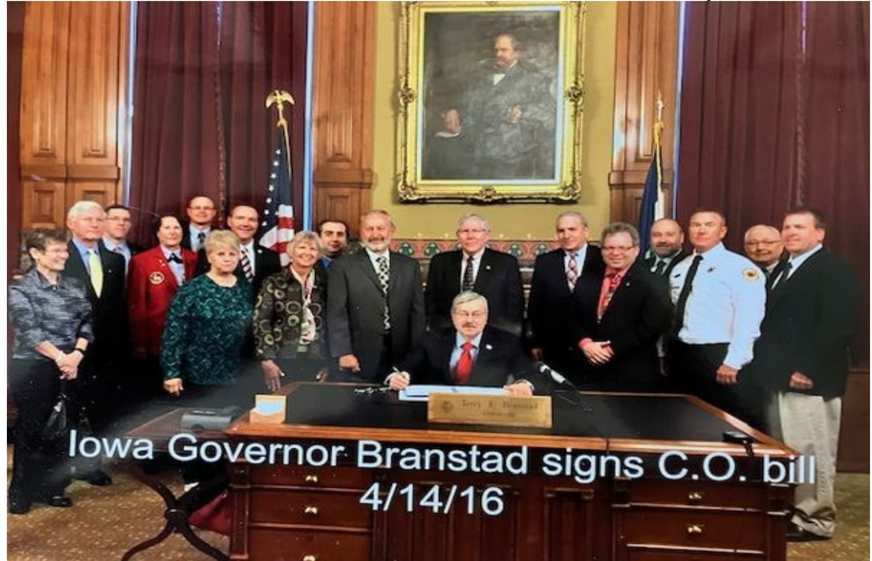
Iowa Governor Branstad signs C.O. bill 4/14/16